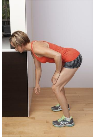
Pic 1 Part B