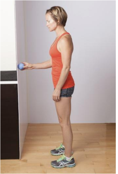
Pic 1 Part A